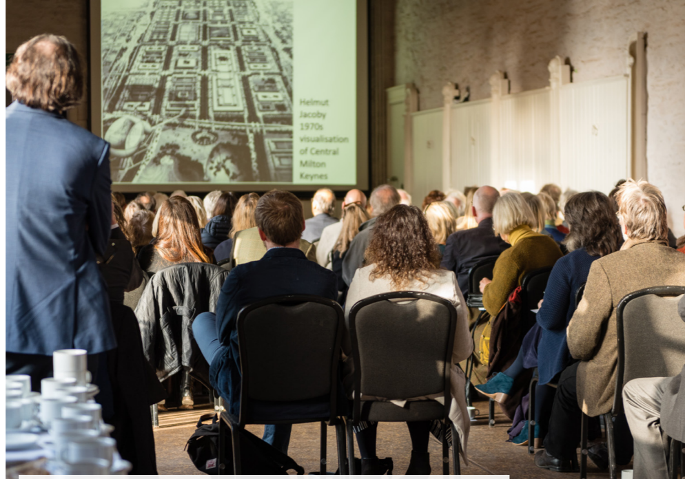
'Taunton Transformed' conference in the beautiful setting of Hestercombe House (hosted by Arts Taunton and the Council in 2018)