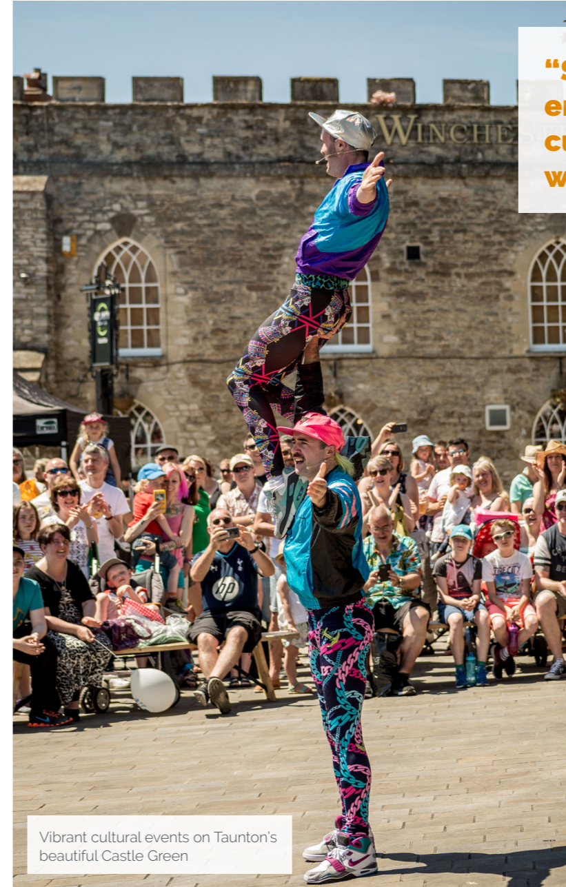
Vibrant cultural events on Taunton's beautiful Castle Green

This cultural strategy is a springboard to a better future. Help us make it happen.