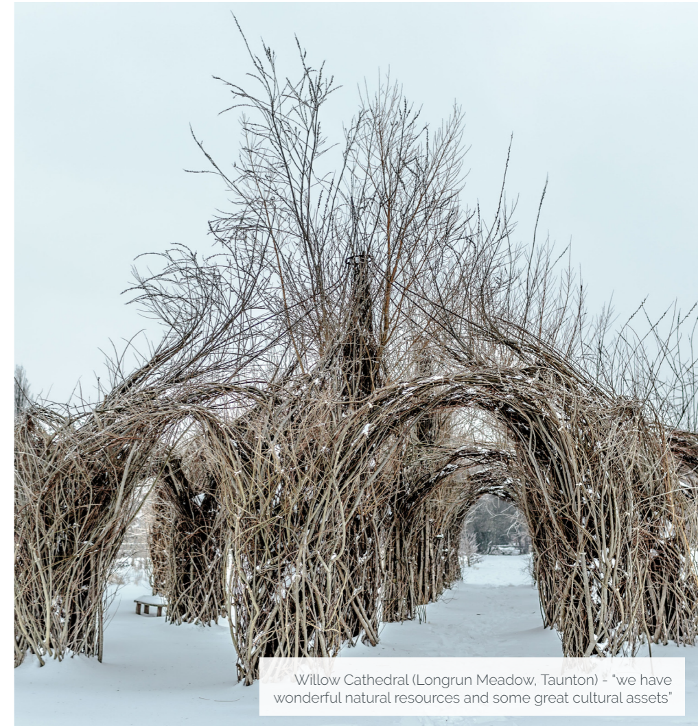
Willow Cathedral (Longrun Meadow, Taunton) - "we have wonderful natural resources and some great cultural assets"