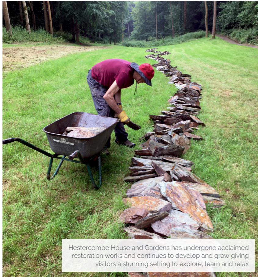
Hestercombe House and Gardens has undergone acclaimed restoration works and continues to develop and grow giving visitors a stunning setting to explore, learn and relax

and value of investment in the cultural sector, however the following are the 6 Value Domains which can be measured to gauge the value of investment and impact on the wider community: