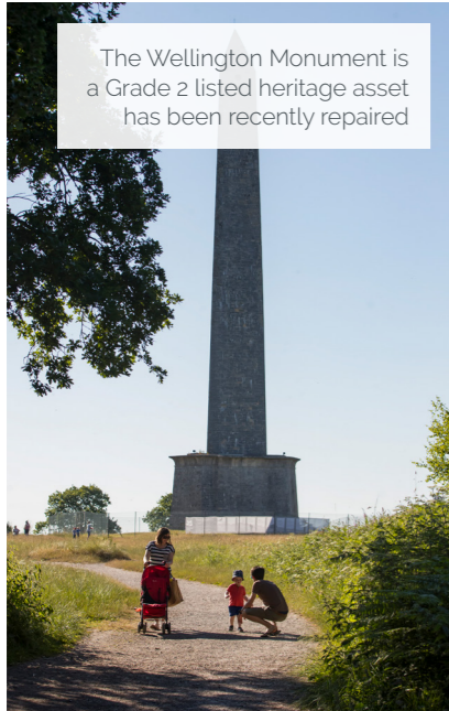
The Wellington Monument is a Grade 2 listed heritage asset has been recently repaired