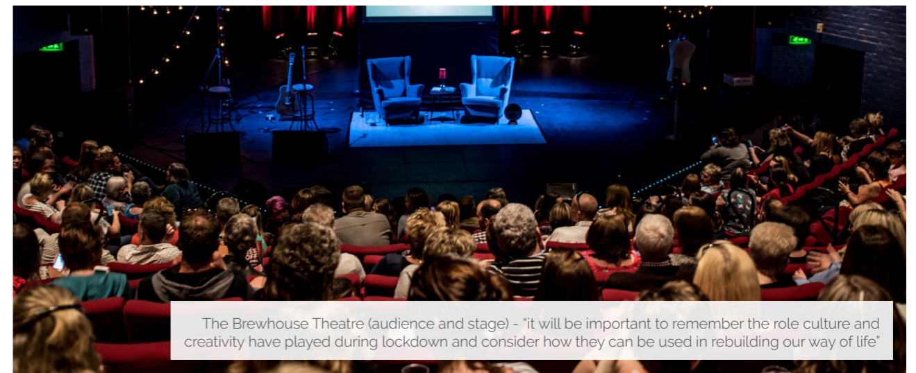
The Brewhouse Theatre (audience and stage) - "it will be important to remember the role culture and creativity have played during lockdown and consider how they can be used in rebuilding our way of life"