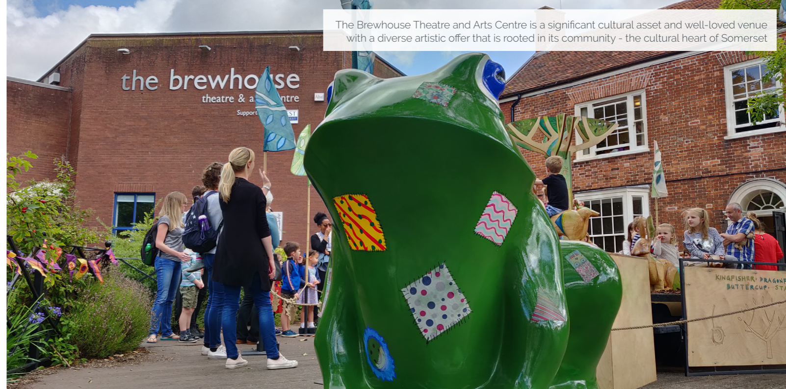
The Brewhouse Theatre and Arts Centre is a significant cultural asset and well-loved venue with a diverse artistic offer that is rooted in its community - the cultural heart of Somerset