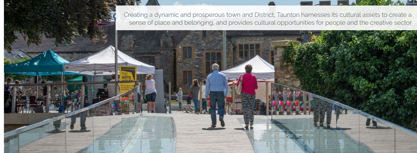
Creating a dynamic and prosperous town and District, Taunton harnesses its cultural assets to create a sense of place and belonging, and provides cultural opportunities for people and the creative sector