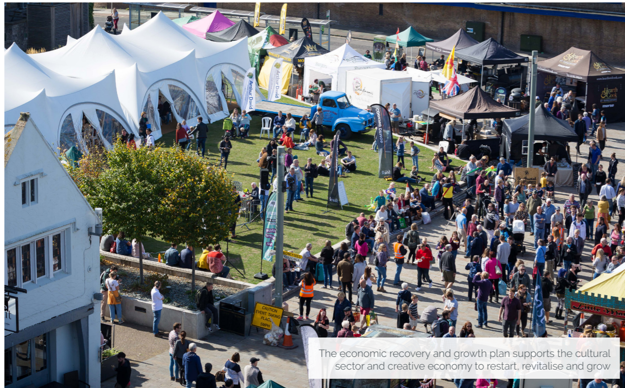
The economic recovery and growth plan supports the cultural sector and creative economy to restart, revitalise and grow