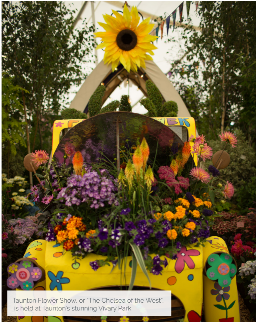
Taunton Flower Show, or "The Chelsea of the West", is held at Taunton's stunning Vivary Park