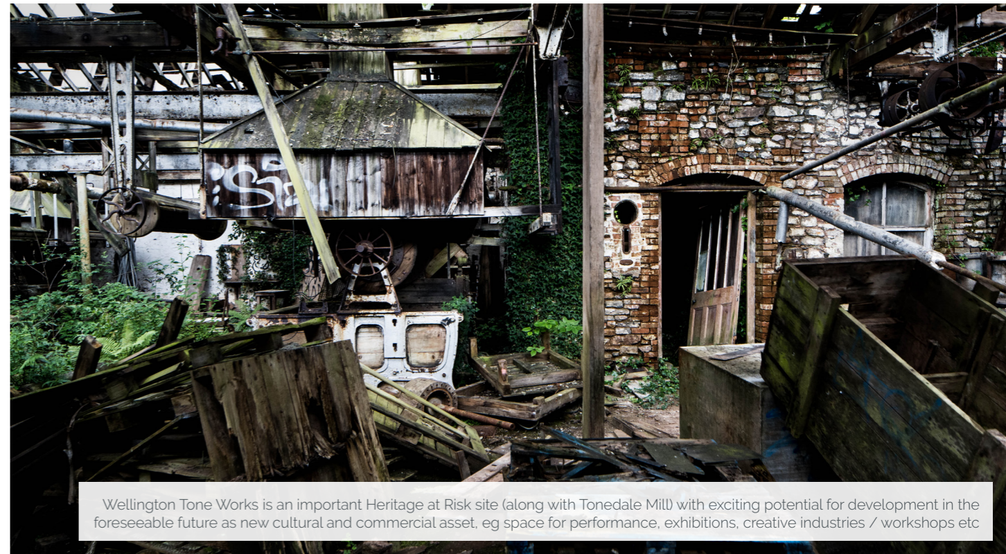
Wellington Tone Works is an important Heritage at Risk site (along with Tonedale Mill) with exciting potential for development in the foreseeable future as new cultural and commercial asset, eg space for performance, exhibitions, creative industries / workshops etc

and economic impacts. Gaining Garden Town status also means Taunton is in a stronger position to attract inward investment that will support our ambition to make our county town a cultural hub in the region. At its centre Taunton has the world class Somerset County Cricket Ground, Brewhouse Theatre and Museum of Somerset. The potential for a new performing arts centre is being explored to match a dedicated cultural quarter. Projects are underway or planned elsewhere that include; the provision of a state of the art creative hub at the historic Watchet Harbour; the creation of a new Country Park on the outskirts of Taunton; the development of Hestercombe House and Gardens; the potential development of Wellington Tone Works and Tonedale Mill.