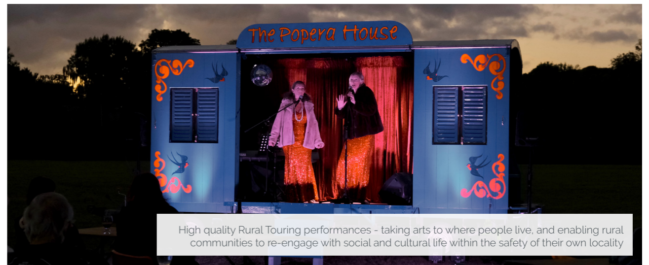
High quality Rural Touring performances - taking arts to where people live, and enabling rural communities to re-engage with social and cultural life within the safety of their own locality