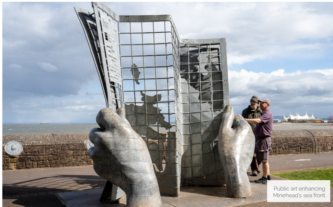
Public art enhancing Minehead's sea front

particularly vulnerable with a coastline, waterways, flood plains and agricultural industry. SWT was among the first 500 regional councils worldwide to declare a climate emergency and mitigating policies and strategies are in place to define our actions. Treating climate change as a 'cross-cutting' theme, we see that the creative industries can help convey complex messages about climate change to communities and want to foster relationships between environmental and creative partners that can result in projects that enhance our environment whilst promoting sustainability.